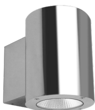
316L SS MIRROR FINISH