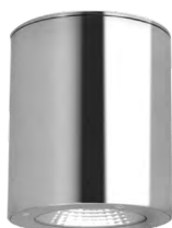
316L SS MIRROR FINISH