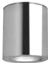
316L SS MIRROR FINISH