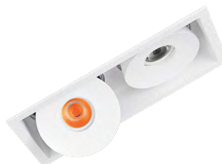
Code: OL Optic lens for more uniform lighting effect (45°)