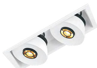
Code: AG Special anti-glare baffle for lower UGR